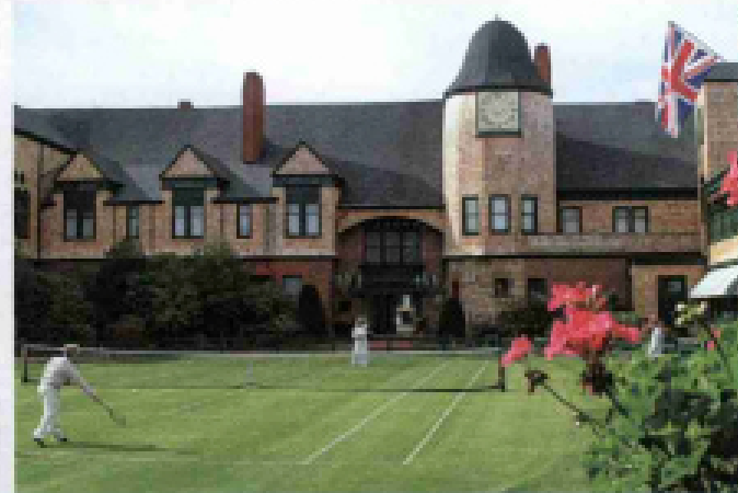
Clockwise: Tour the Breakers, a favorite of the Newport mansions; Get some R&R in the Renaissance room at The Chanler located on Newport's famous walking path, the Cliff Walk; Tour the Tennis Hall of Fame or grab your racket and play a game; Sleep in style close to downtown at the Vanderbilt Grace.

from the Gilded Age, are available for tours. Four of them, The Breakers, The Elms, Marble House, and Rosecliff, have self-guided audio tours, so you can move through the home at your own pace, generally 30-50 minutes. Stand in awe at the opulence of these huge homes where gold, silver, and jewels adorn the inside and out from top to bottom. Be sure to tour the gardens, which are just as lavish. Several mansion packages are available, single property visits start at adults $14.50, ages 6-17 $5.50, 401-847-2251, www.NewportMansions.org .