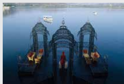
From the moment your boat arrives at the Taj Lake Palace's ornate jetty (bottom left), you'll feel like royalty, whether you're lounging poolside on a cushioned recliner (above) or relaxing in your opulent suite.