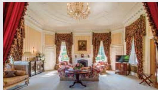
The grounds of Glenapp Castle and its Azalea Pond (above) are breathtaking when spring brings its rush of color. (Right) The Earl of Inchcape Master Suite, with its views of Ailsa Craig, is among the most opulent guest accommodations in the castle.