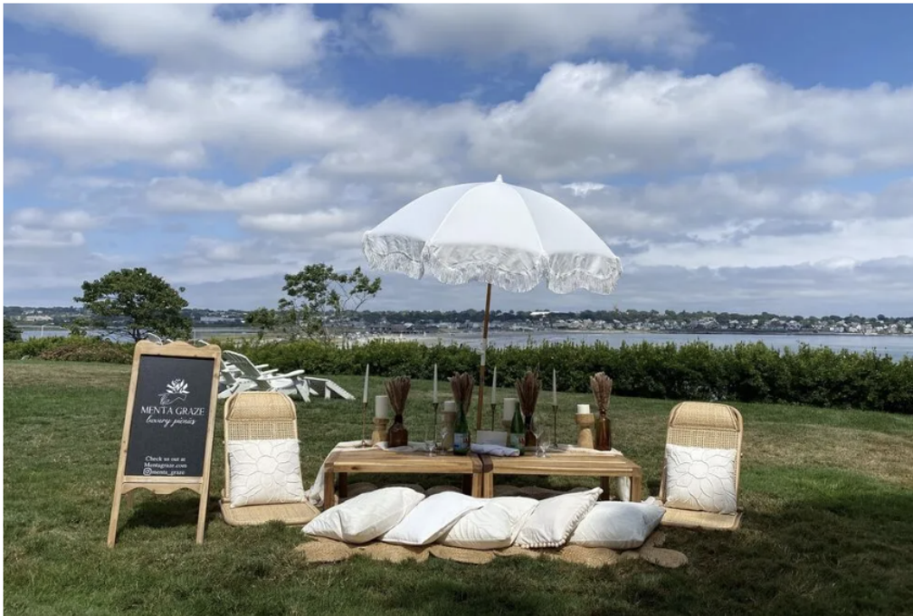
Picnic on the lawn at The Chanler at Cliff Walk

Restaurants shifted to outdoor dining early in the pandemic. What started as necessity has sprouted a cottage industry of companies providing luxury picnics. Planning a perfect picnic isn't easy; selecting foods that complement each other and stay fresh, plus creating floral centerpieces that are sturdy yet pretty, is practically an art form.