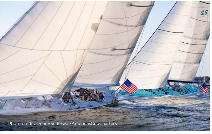
Lani Shufelt The Proprietress