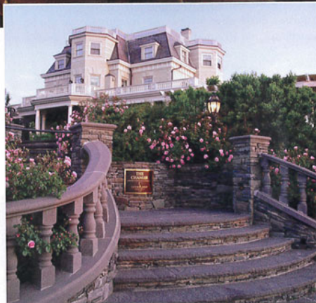
Top: The English Tudor room, one of 20 unique and lavish guest rooms at The Chanler at Cliff Walk, evokes the feel of Tudor England with its hand-carved wood paneling and ornate fabrics. Inset: Once a private summer home, The Chanler is set on Newport's famous Cliff Walk, a 3.5 mile long public walkway with fantastic ocean views. Seen here is a view of the hotel from the walking path.

The Chanler at Cliff Walk's restaurant, Spiced Pear, is another reason to visit — even if you're not a hotel guest. A high-end, fine dining