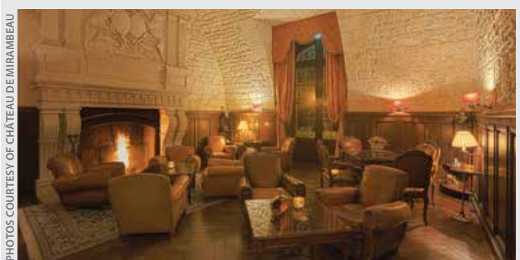
From its exterior appearance to its interior décor, Château de Mirambeau fulfills all your castle fantasies. A special feature of this castle is its Cognatheque (bottom photo), where locally made Cognac can be enjoyed.