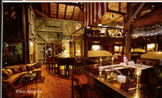
White Barn Inn

While the country heats up for summer, there's no reason to head down south. Just a short drive north of us are some of the most fantastic summer destinations in the country, and we've got your roundup right here.