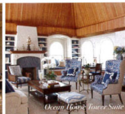
Ocean House's lower suite