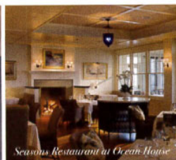
Seasons Restaurant at Ocean House