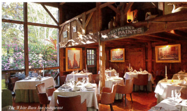
The White Barn Inn restaurant

Enter the circular drive and head into the lobby with its charming original fireplace, restored parquet flooring and shining crystal chandelier and you've instantly traveled back in time. You are the social