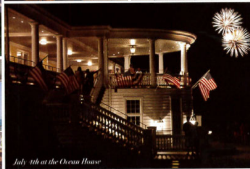
July 4th at the Ocean House

the ocean from there as well. Wind your way through a private garden path to a locked gate, which opens into each villa's private courtyard. Walk a narrow path up towards your room, and you'll notice a private hot tub perfectly suited for New England's crisp summer evenings.