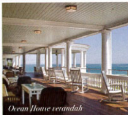
Ocean House veranda