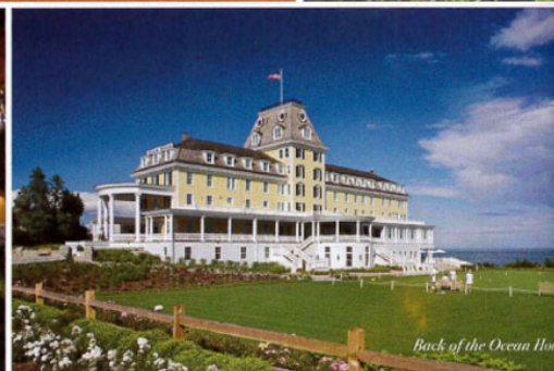
Back of the Ocean House